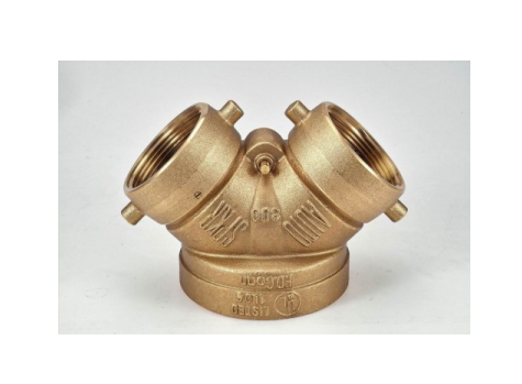
Fire Department Connection, straight type

Sunpool was founded in 1983 by Mr. Jackson Chen. In early stages, Sunpool just manufactured Cam and Groove hose couplings and related hose coupling. In 1998, we started producing various Fire Fighting equipment by a joint venture in China. Our major precuts are listed below: 1. Hose couplings. 2. Fire fighting equipments including UL/FM certific ... [more]