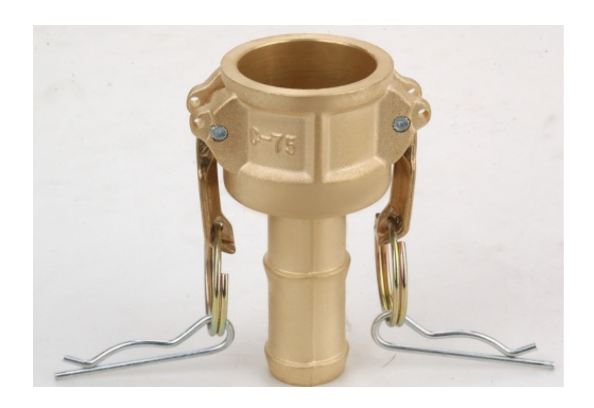
Cam & Groove couplings