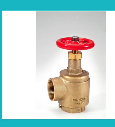
Brass fire hose valve, UL/FM listed