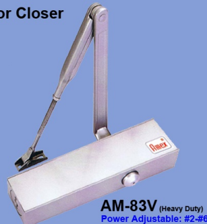
AM-83V (Heavy Duty) Power Adjustable: #2-#6