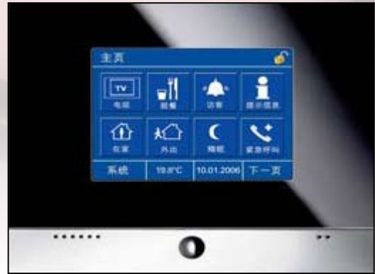
Indoor phone extension