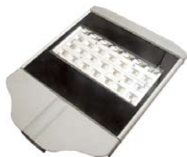
Street Light Series