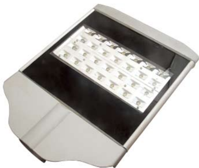
Street Light Series