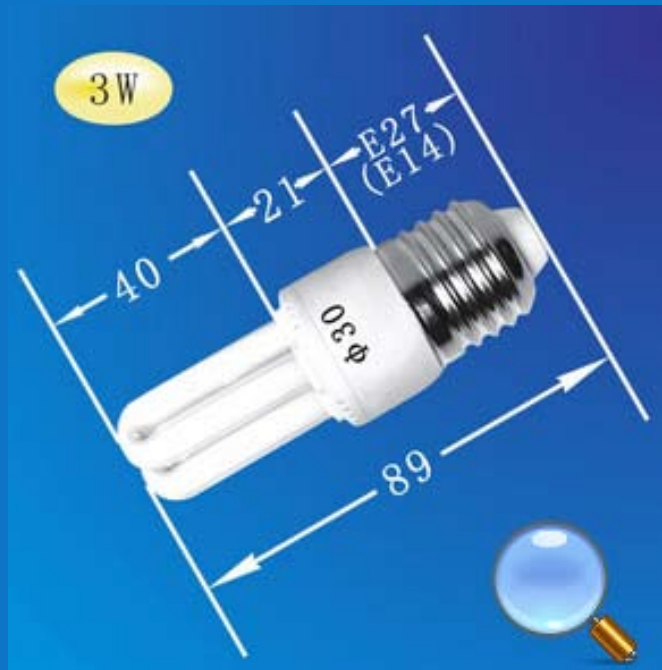
Electronic Energy-saving Lamp: 30 Series: T2 2U 30 3W/5W/8W/10W