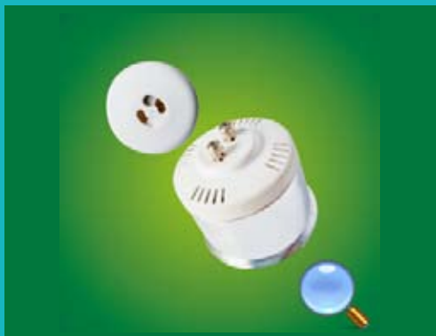
Light Source: TC: GU10

Located by the West Lake, Tiger Electron & Electric has a 15,000 square-meter factory and 300 workers, integrating R&D, production, and sales of compact electronic energy-saving lamps, with annual production of lamps totaling 30 million, annual exports valued hundreds of million RMBs. Our products are exported to Europe, the America, Africa, and Asia.