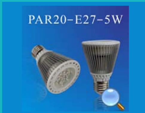
LED: LED Spotlight: 2013 NEW LED PAR20 Reflector Lamp 5W