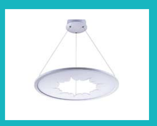
Round panel light