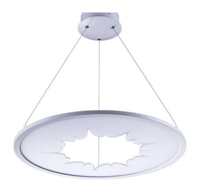
Pendant LED panel light