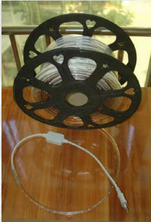
High-voltage Normal Flexible LED Strips