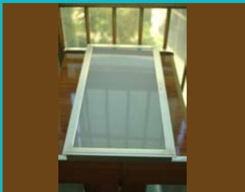
LED Panel Lights