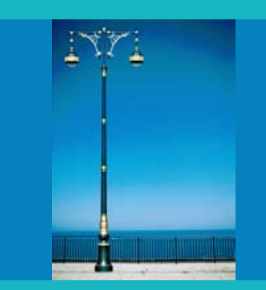
Street Lighting Series- Pumpkin Light