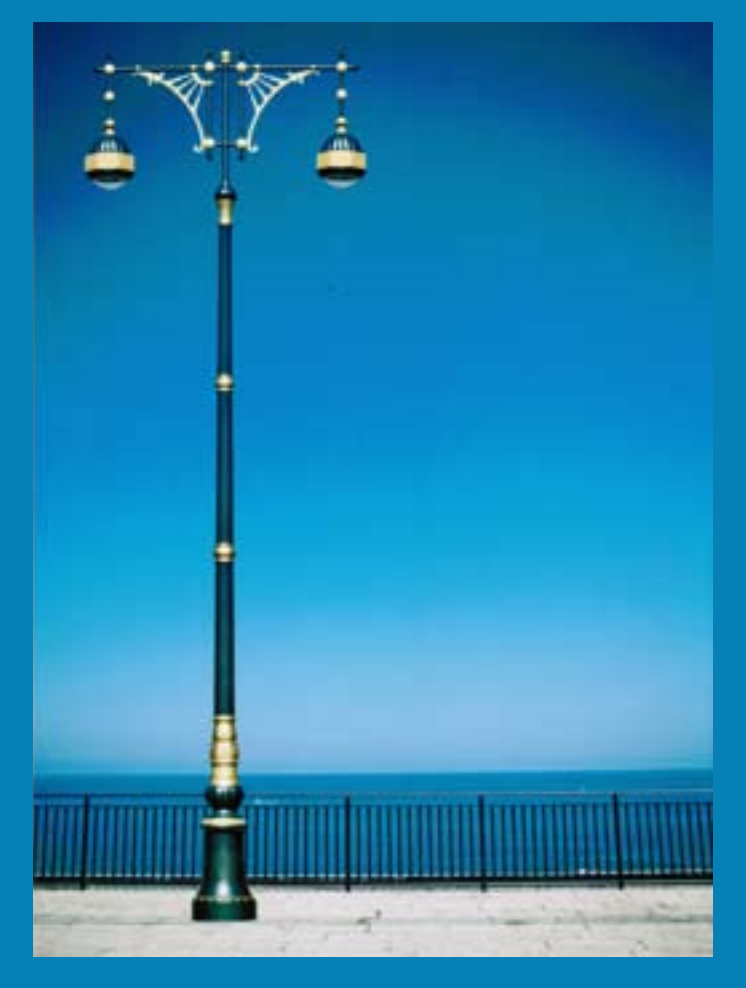
Street Lighting Series- Pumpkin Light