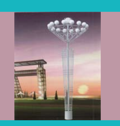
Landscape Series- JGD002