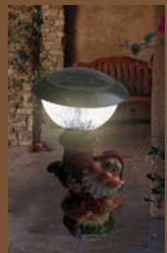
LED solar-power-application series