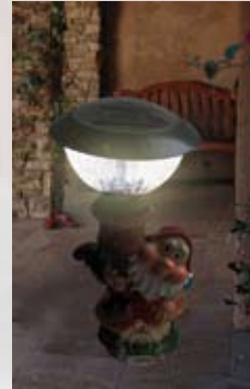
LED solar-power-application series