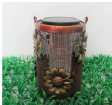
LED outdoor lighting