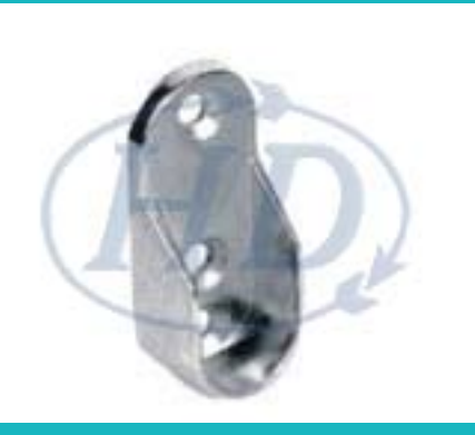
Hanging Rail Tube Support

A manufacturer and exporter of furniture hardware, HD Hardware Co., Ltd. have more than 600 staff, 3 workshops, and a large number of automatic machines for stamping, molding, hardware polishing, zinc alloy die casting and electroplating, also focusing on long-term training of workers.