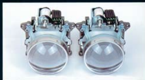
S40 bosch bi-xenon projector lens