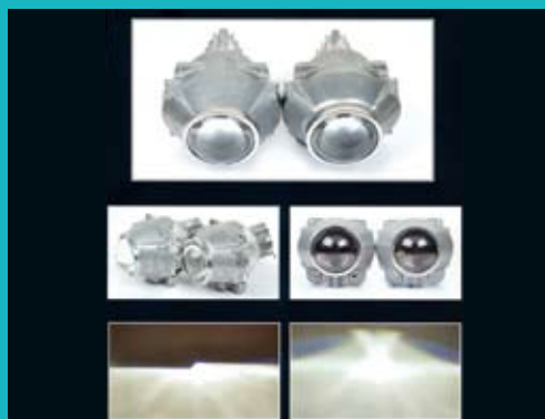
Stanley Bi-xenon projector lens

Guangzhou AES car parts company, combining with development and research, production and sale, mainly supplies light source of automotive headlamp (originally imported and made in China HID ballast, HID bulb, HID bi-xenon projector lens and all series parts of automobile headlamp), DAD luxury automotive decoration and all kinds of retrofit parts.