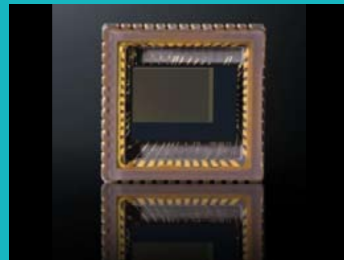
CMOS Image Sensor Chips