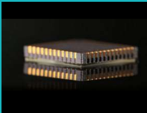
CMOS Image Sensor Chips

Since its establishment in 2008 in Kunshan City, Brigates Microelectronic Co., Ltd. has developed 9 CMOS image sensing chip models, including exclusive hi-speed IR 3D, 5-entity hi-speed parallel, and 130 nano-processed image sensor chips. We have also successfully mass-produced 5 models, which have sold over a million pieces throughout 2010, helping us to build a solid foothold in the field.