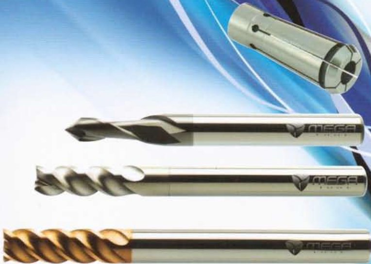
Solid Carbide & HSS End Mill