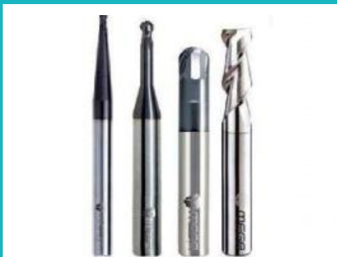
Solid Carbide & HSS End Mill

We are known for our powerful and precise milling cutters range from solid carbide end mills, HSS end mills, reamers as well as other machine tools –holder and collects ..etc.