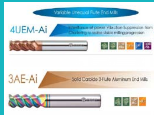
Variable Unequal Flute End Mill