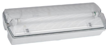
Emergency Waterproof Lighting / Emergency Bulkhead