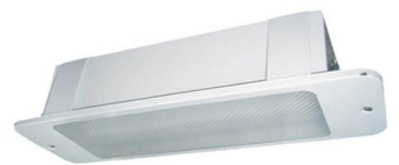
Emergency Waterproof Lighting / Emergency Bulkhead