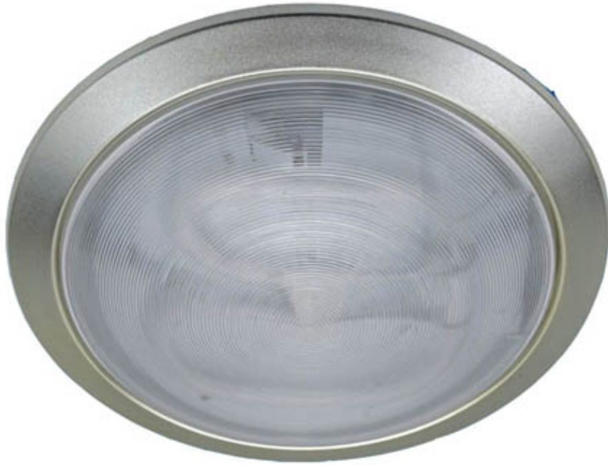
Emergency Lighting / Emergency Bulkhead