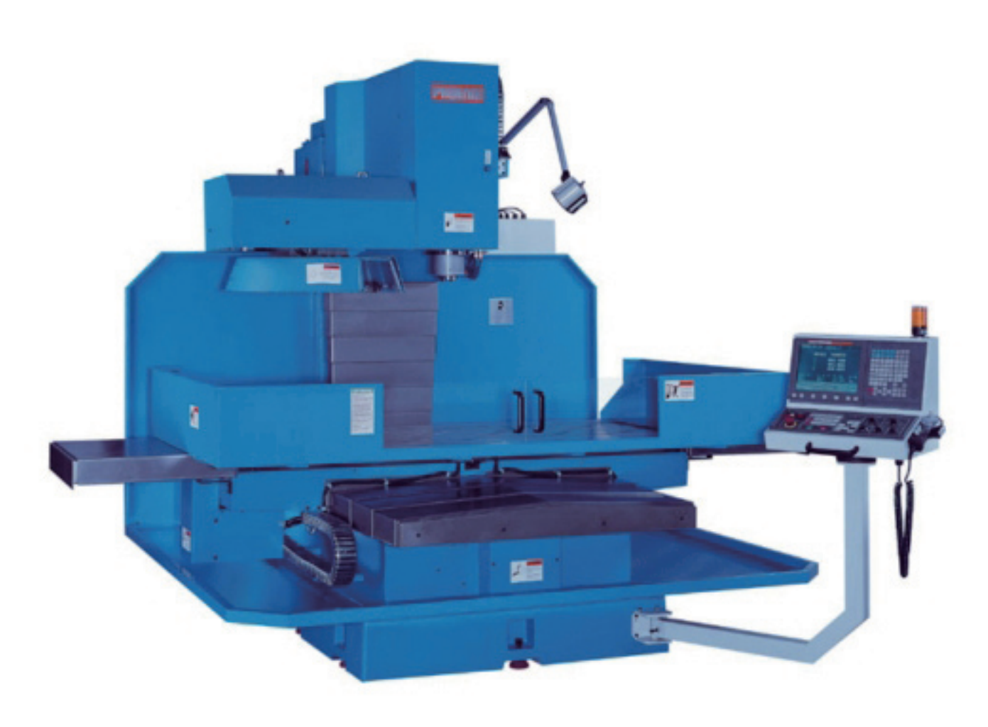
Bed type CNC milling machine