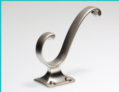
Furniture Hardware Parts Solid Brass Hook