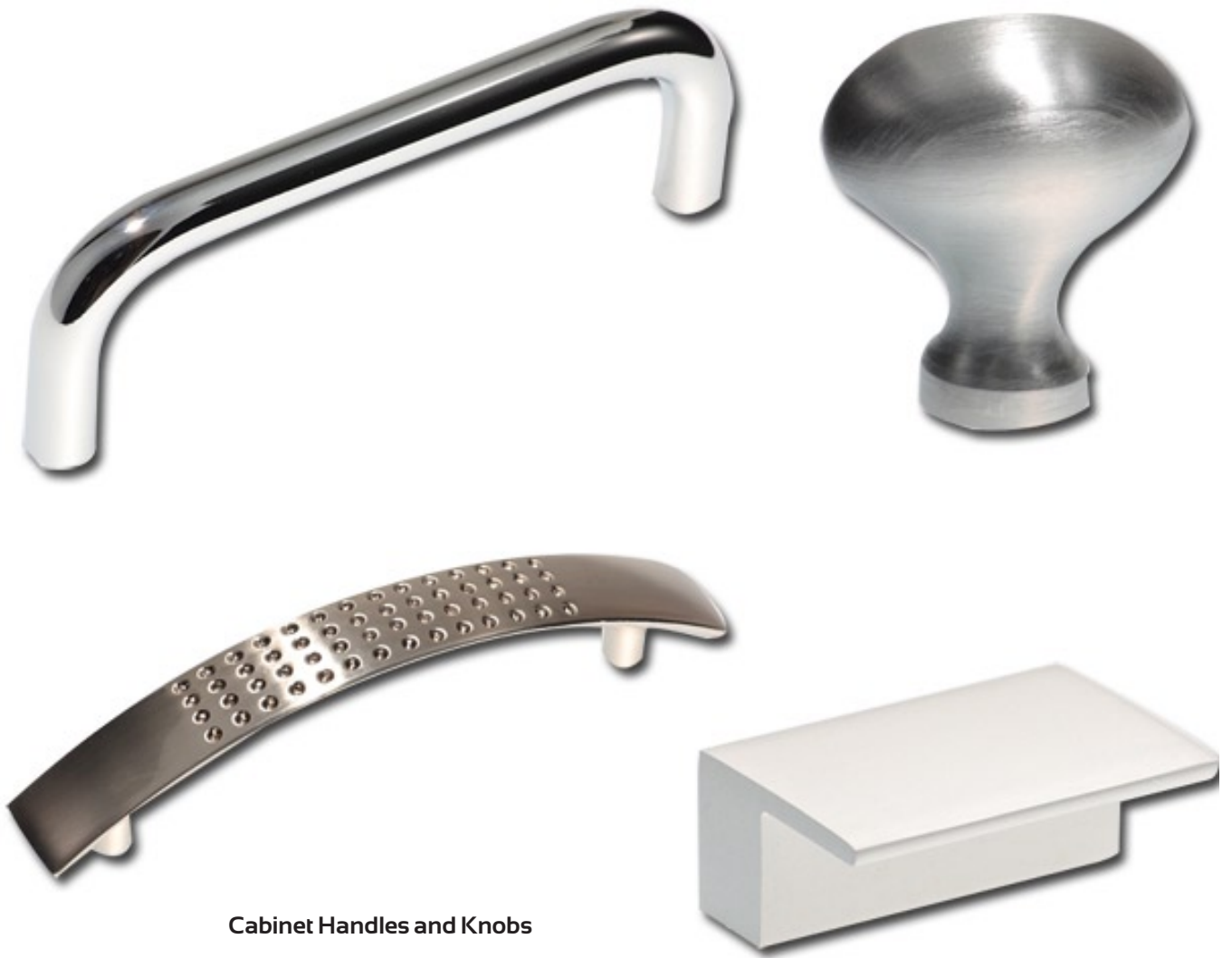
Cabinet Handles and Knobs